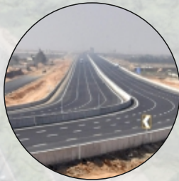
Inside proposed Regional Ring Road