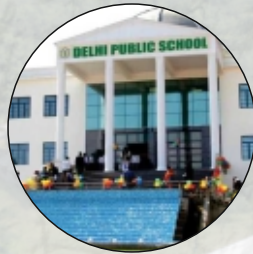
Delhi Public School